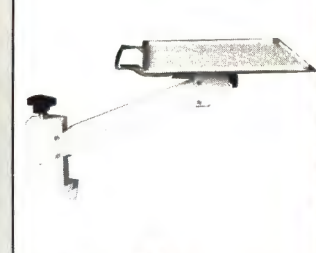
NORMAL R.R.P. £95.00